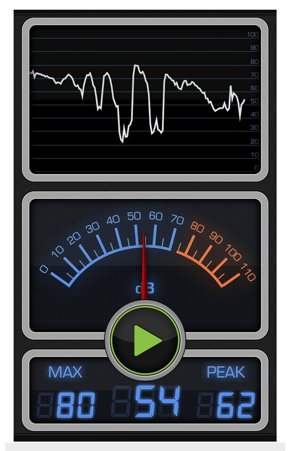
FIGURE 3: Decibel X.

Decibel X is a tool that we used to measure sound intensity from our Android phone.